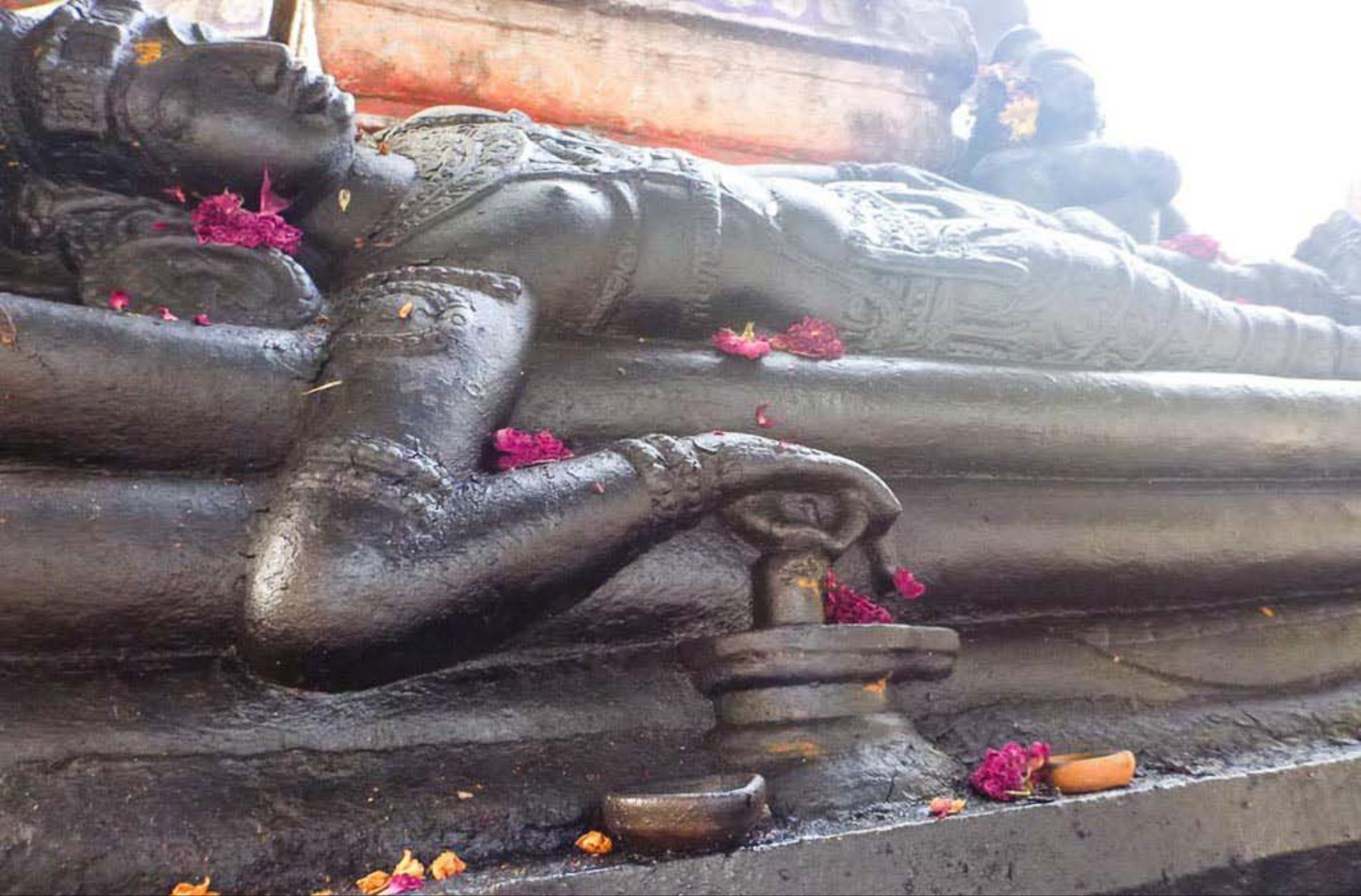
Vishnu is shown reclining on the coils of Adi Sesha - a cosmic snake. As he reclines, Vishnu makes offerings onto the Shiva lingam.