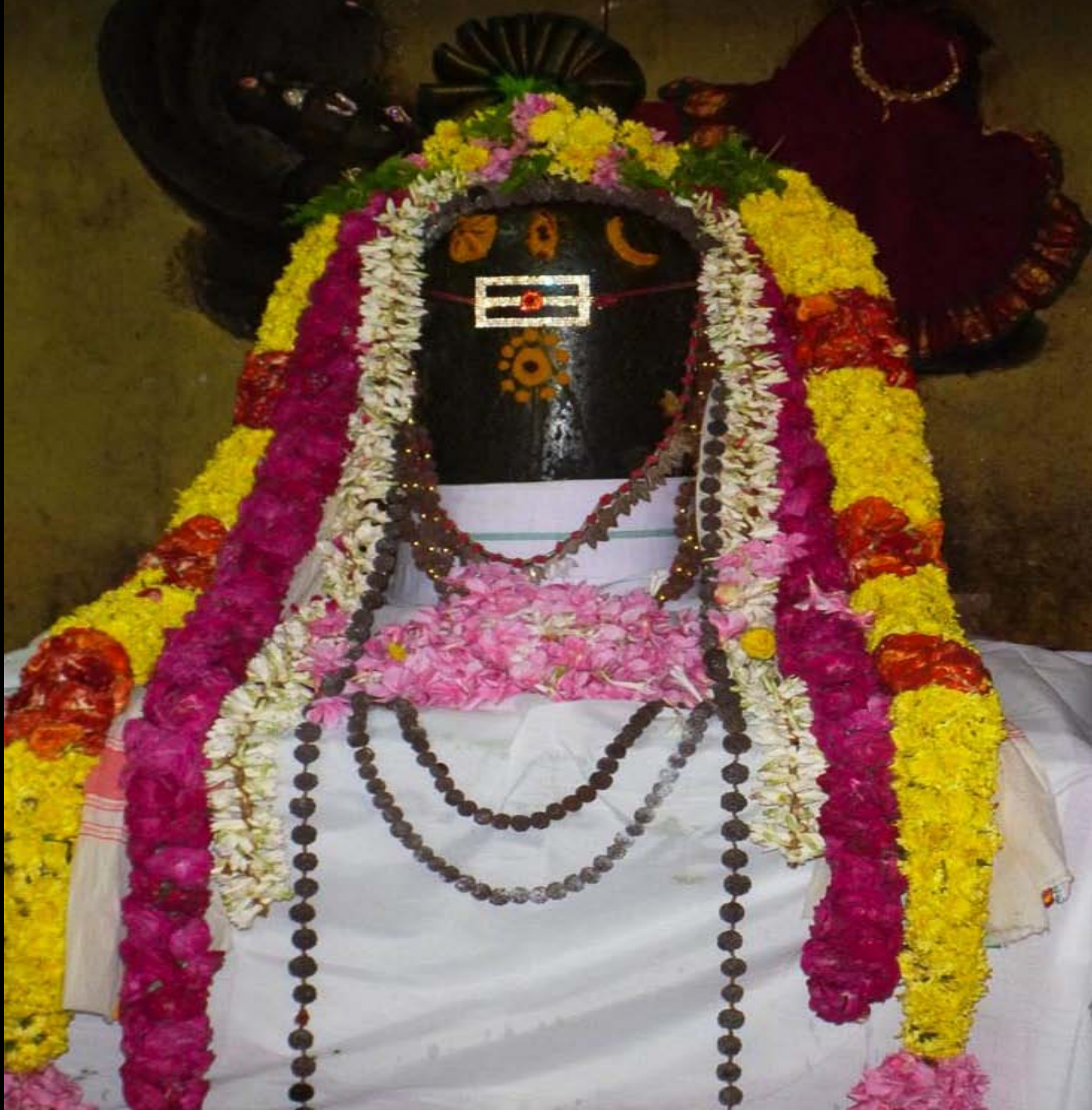
The Shiva lingam after the abhishekam looks festive and will be enjoyed by all who visit the temple.