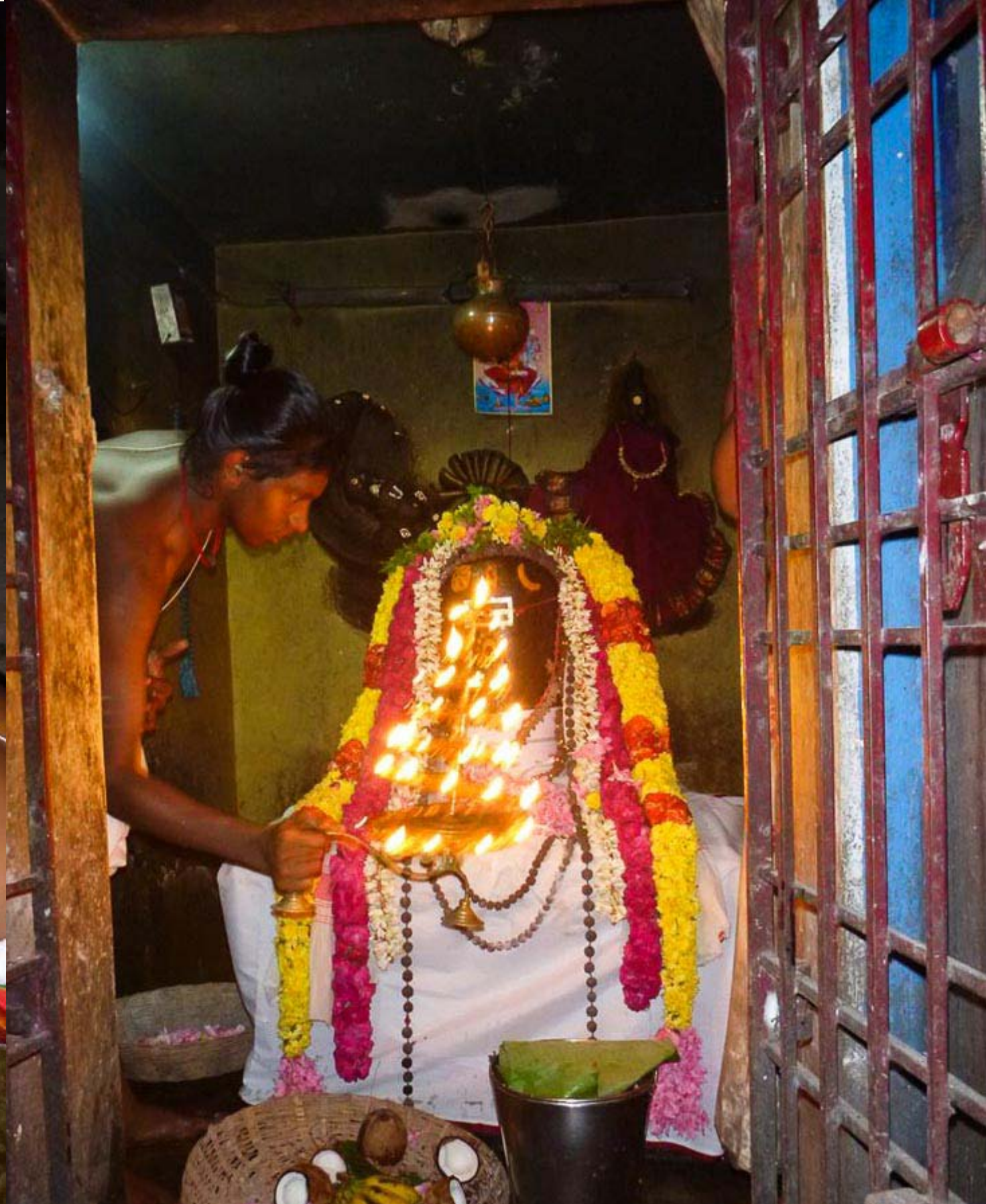
The young priests prepare the aarti lamp and perform the final offering of light at the conclusion of the yagya.