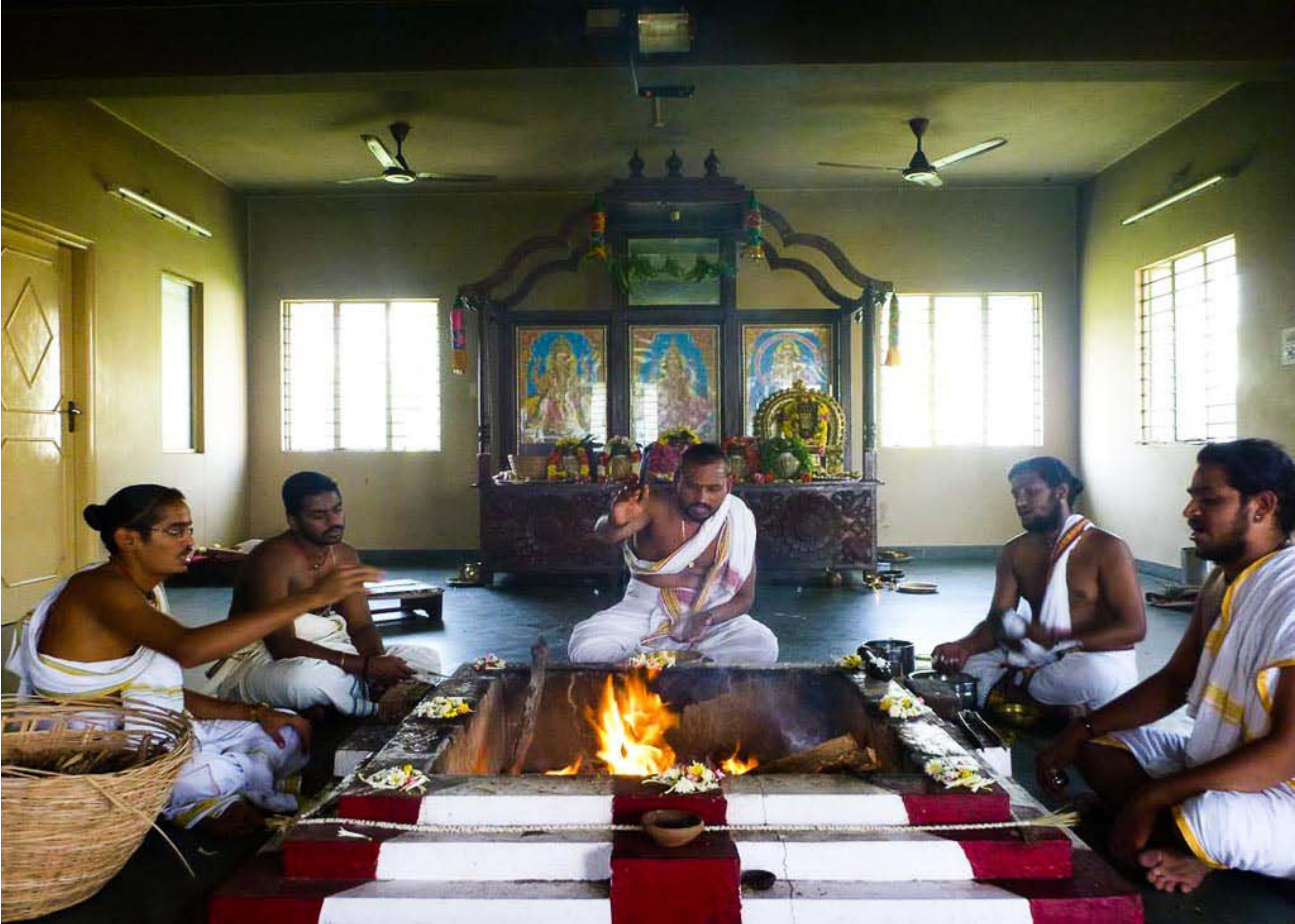
After the pujas are completed, the priests make offerings of ghee, wood and other items into the sacred yajna fire as mantras are chanted.