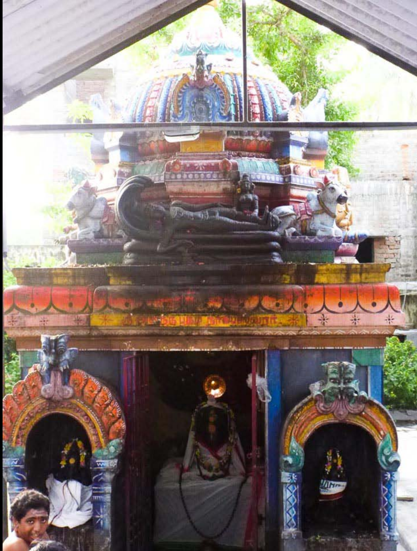
You can see Vishnu, reclining on the roof of the temple, with the Shiva lingam in the sanctum below. There are many stories of Shiva, Vishnu and Brahma that take place in Kanchipuram.