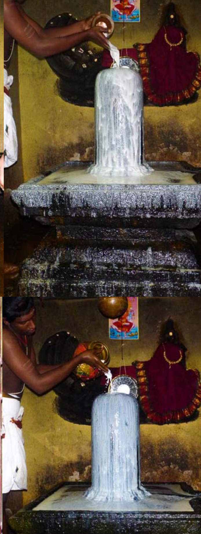
The abishekam is beautiful with offerings of dark brown sandalwood, light yellow tumeric, and milk. On the wall behind the lingam you can see an image of Vishnu reclining on Adi Sesha and Lakshmi in her red sari.