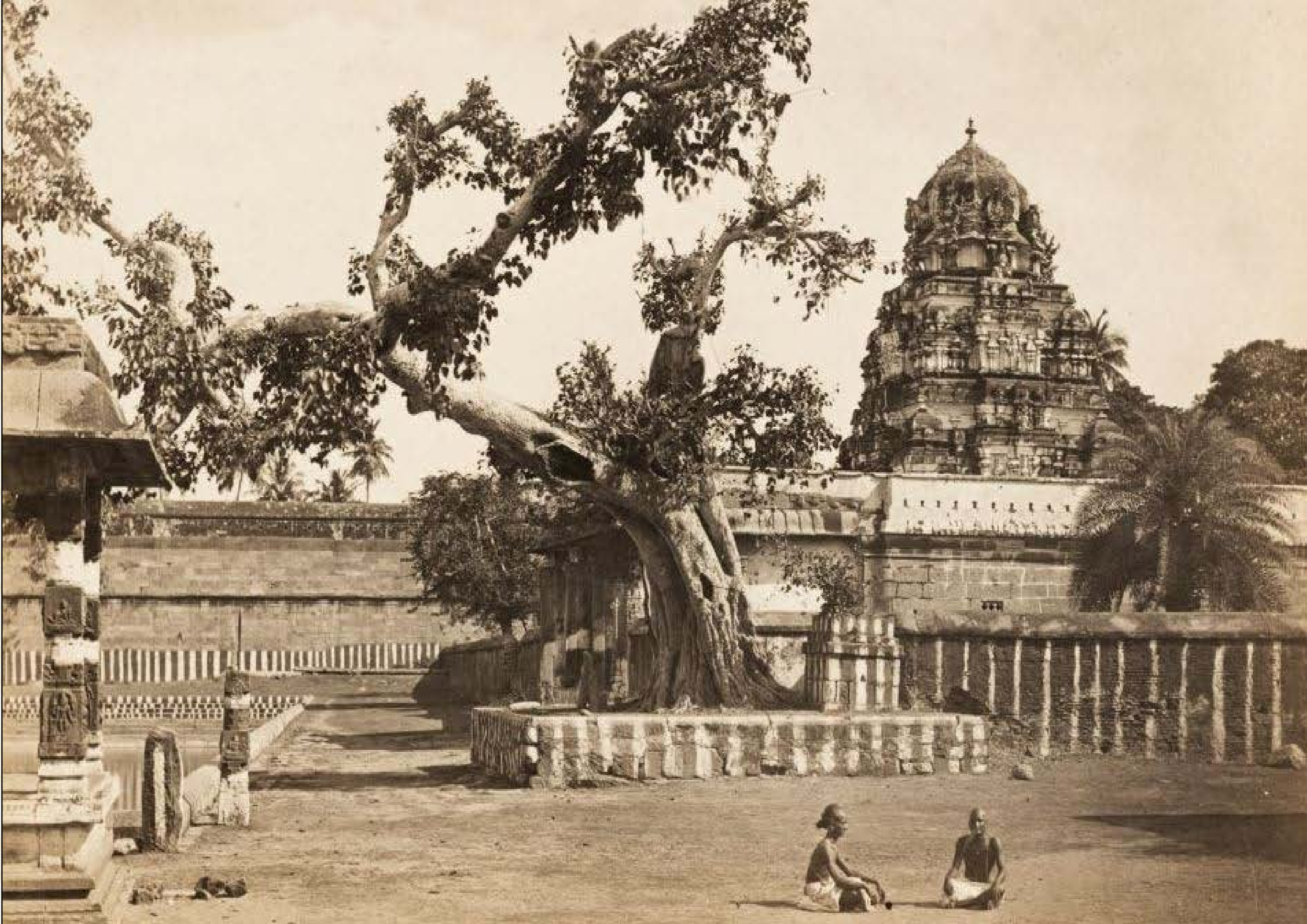
We performed the last day of the yagya series at the Subramanya temple located at the entry to the Ekambeshwara temple in Kanchipuram. This photo of the Ekambeshwara temple was taken in 1870 and shows the famous mango tree outside the Parvati temple.