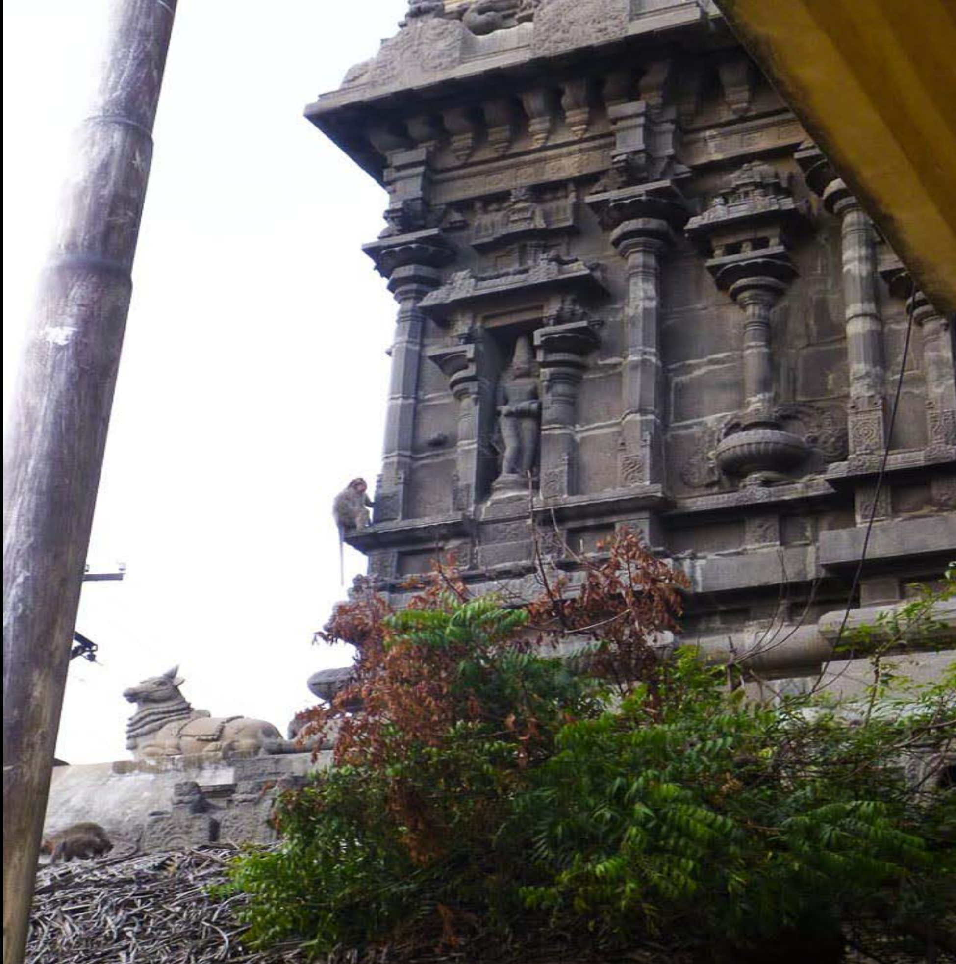
Outside the Subramanya temple, the monkeys are ready for the yagya to begin. They know they will receive prasadam bananas.