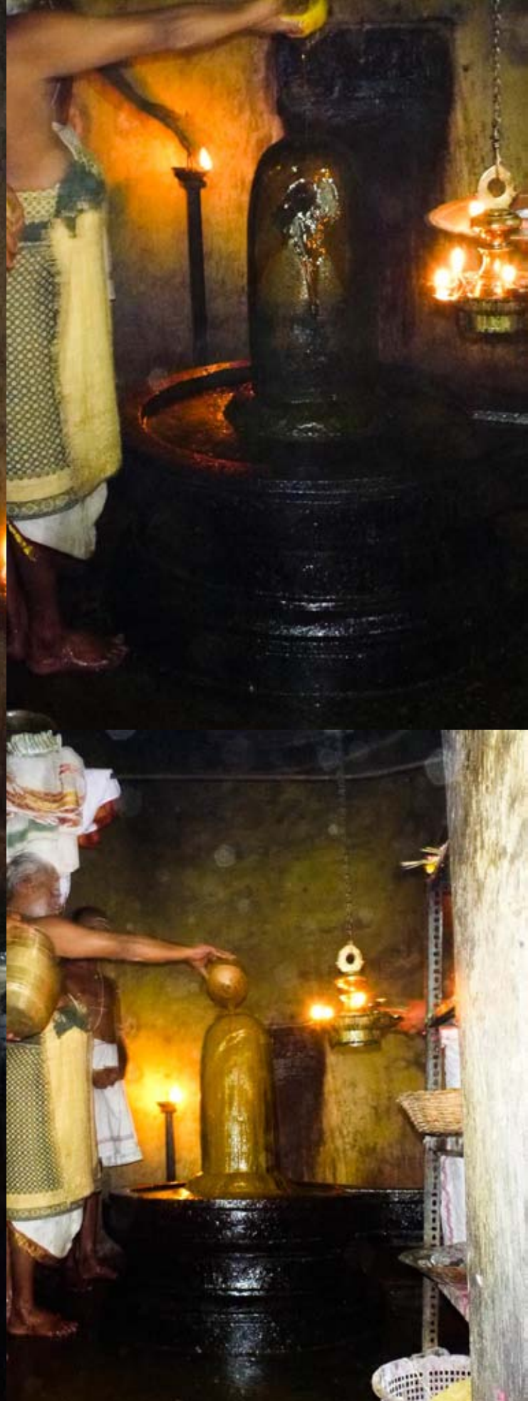
The Rudra Abishekam is very impressive and the ancient Shiva lingams can be quite large, many of which are over one thousand years old.