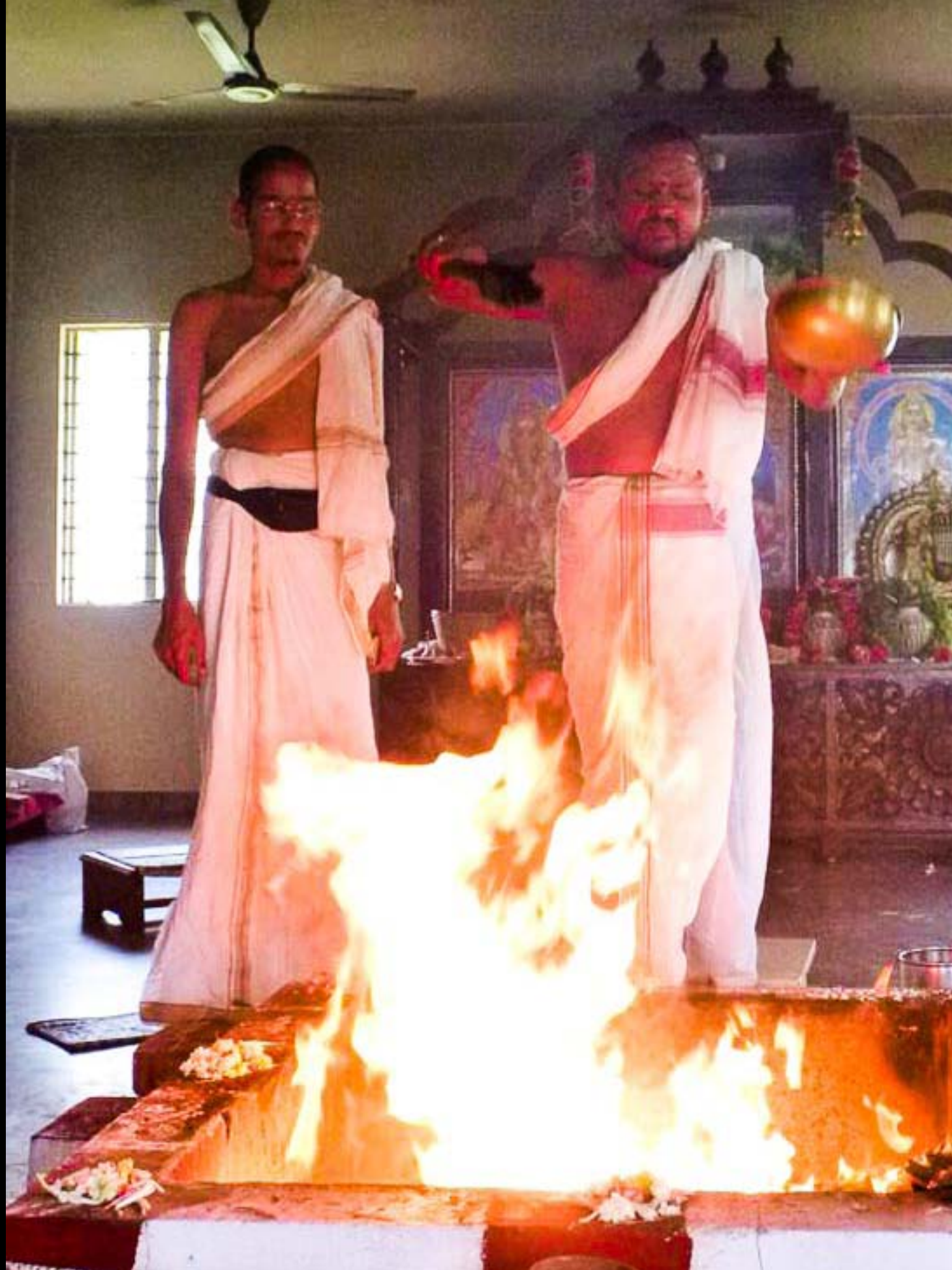
The final offering at the conclusion of the fire ritual is always dramatic as the ghee makes the flames leap up high.