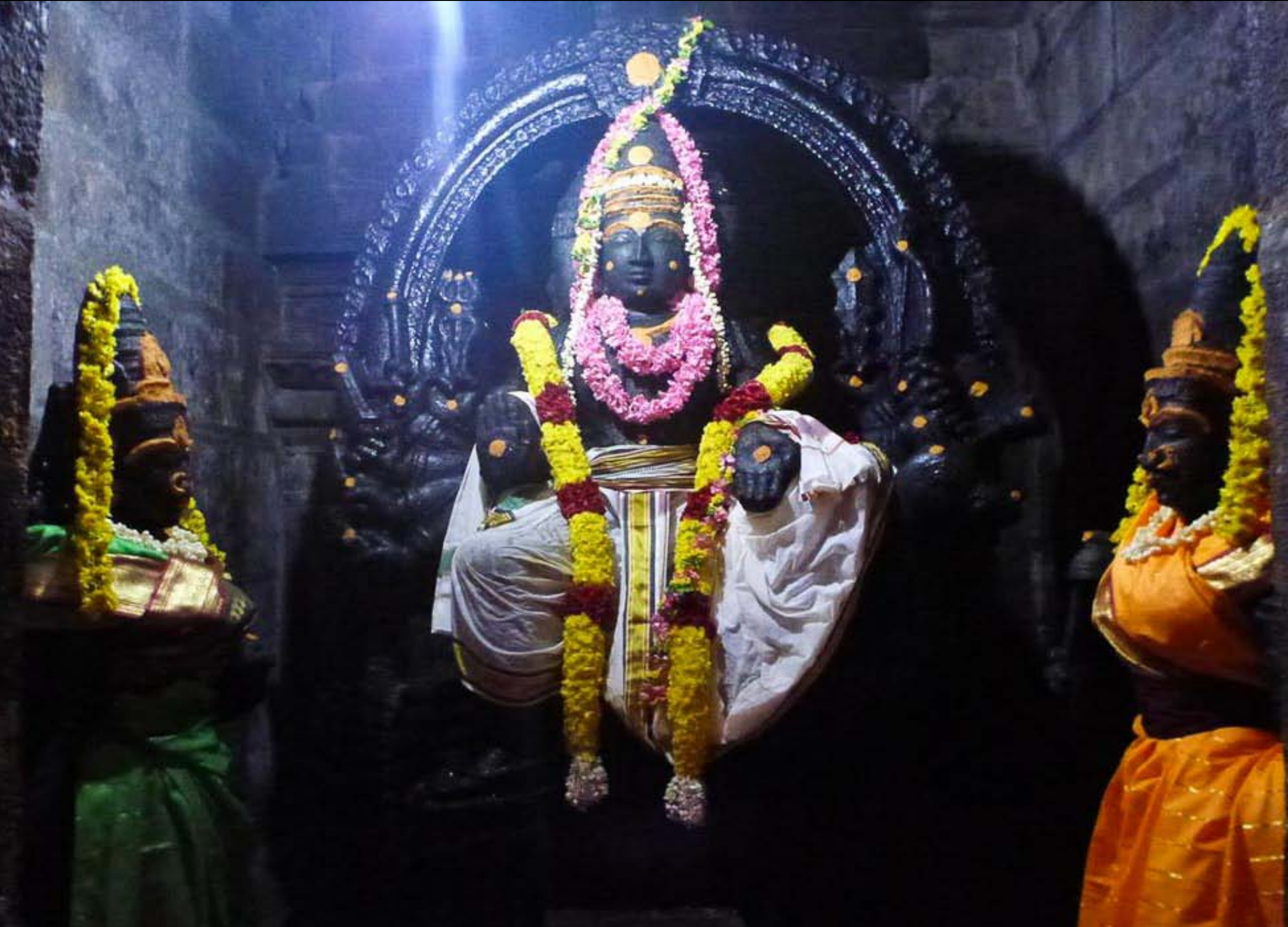
At the conclusion of the yagya Subramanya looks regal, powerful and peaceful.