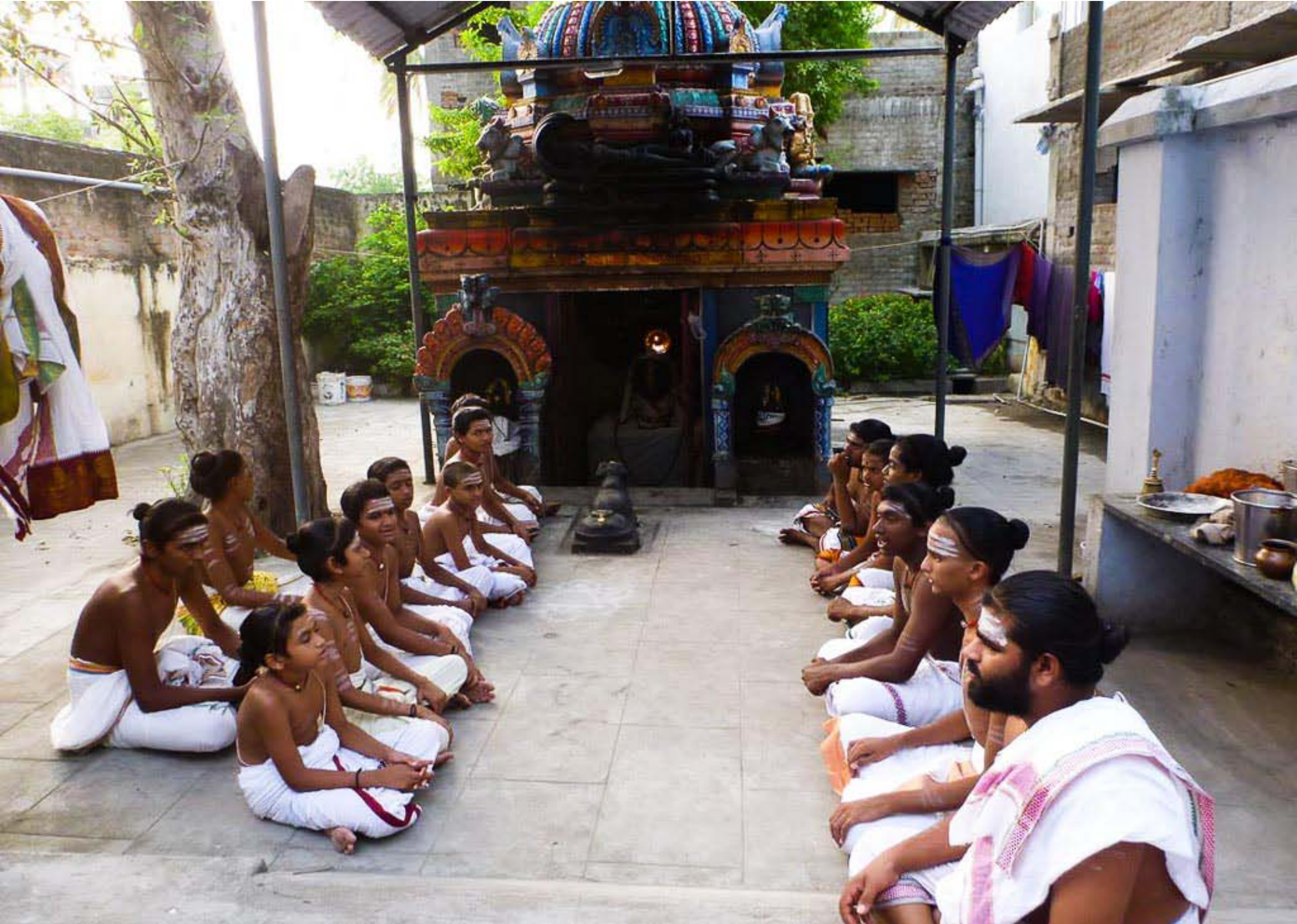
The second of our temple yagyas took place at a temple that contains both Vishnu and Shiva. This combination is very rare. We often include young Brahmins so they have experience performing the yagyas with our more experienced priests.