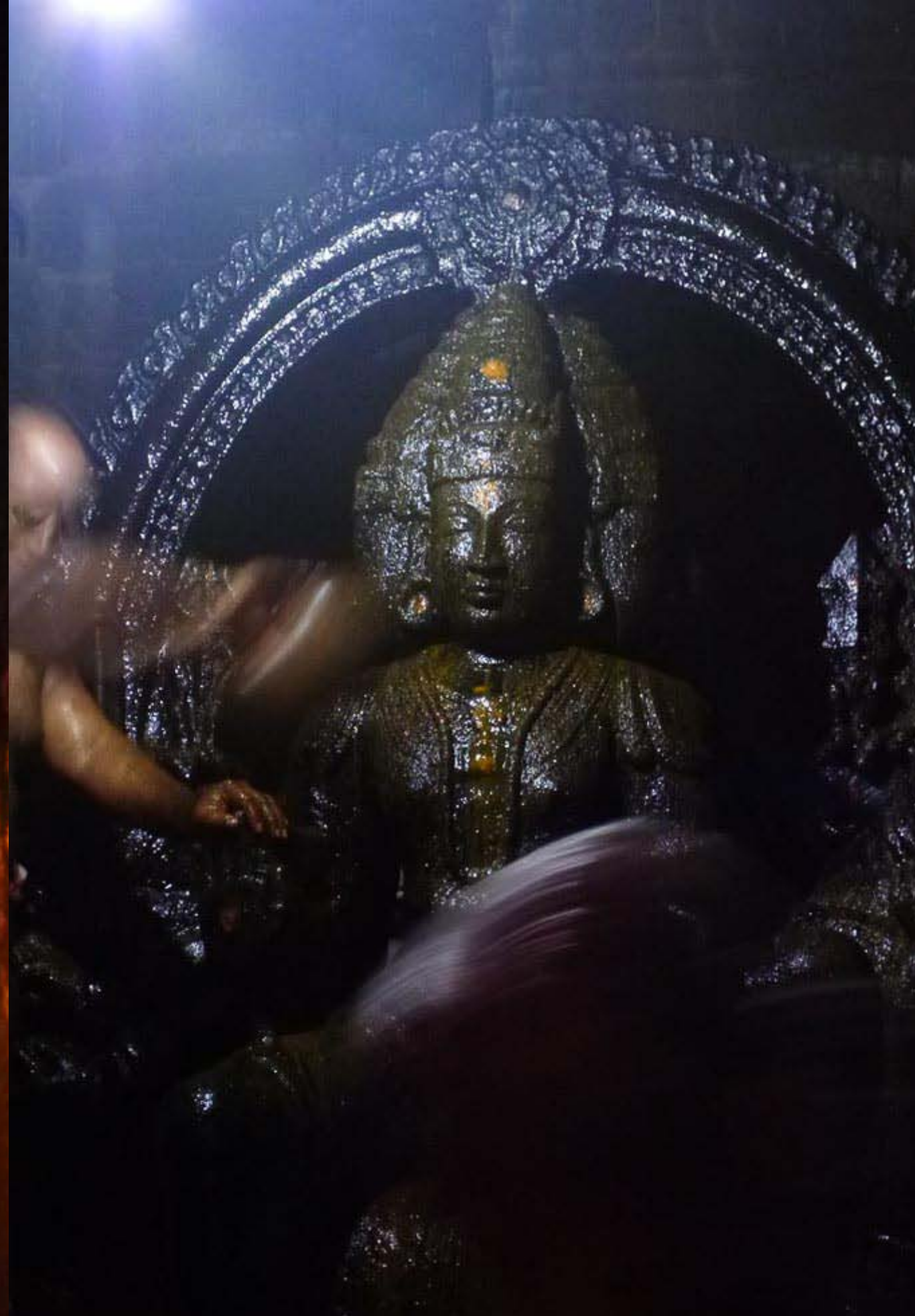
The Subramanya temple is large and impressive.