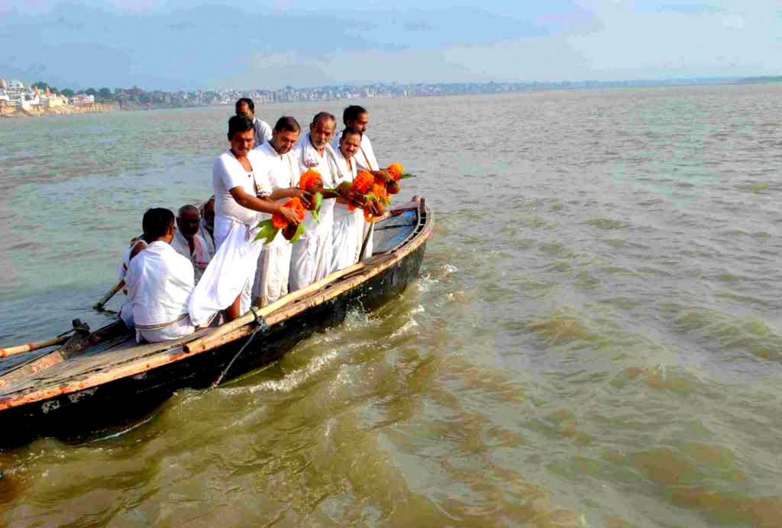
The priests take the clay pots and flower malas out into the current of the Ganga.