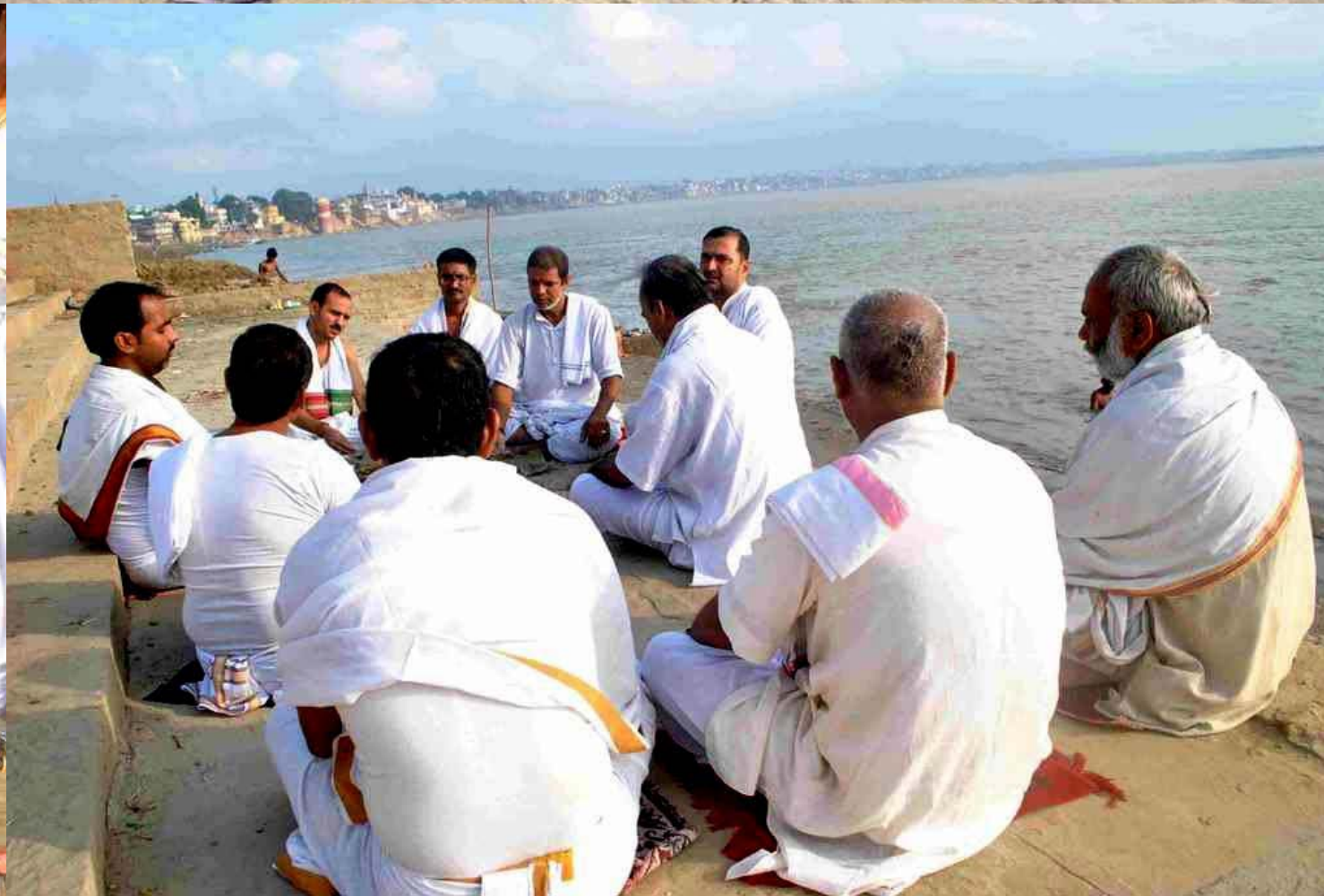
The yagya begins with pujas and offerings of fruit and flowers which are then dropped into the river (lower left). Then the yagya fire is lit and the offerings of sesame seeds and ghee are made into the flames.