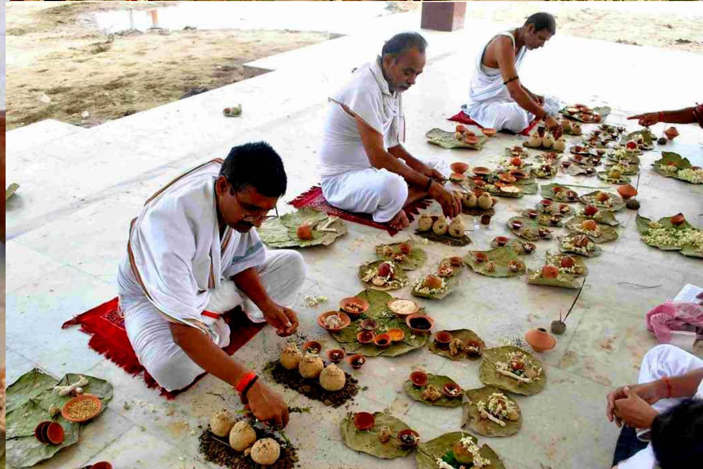
Notable are the “pinda-daan”, balls made of rice and barley flour mixed with ghee and black sesame which are symbolically fed to the ancestors as a part of the ritual.