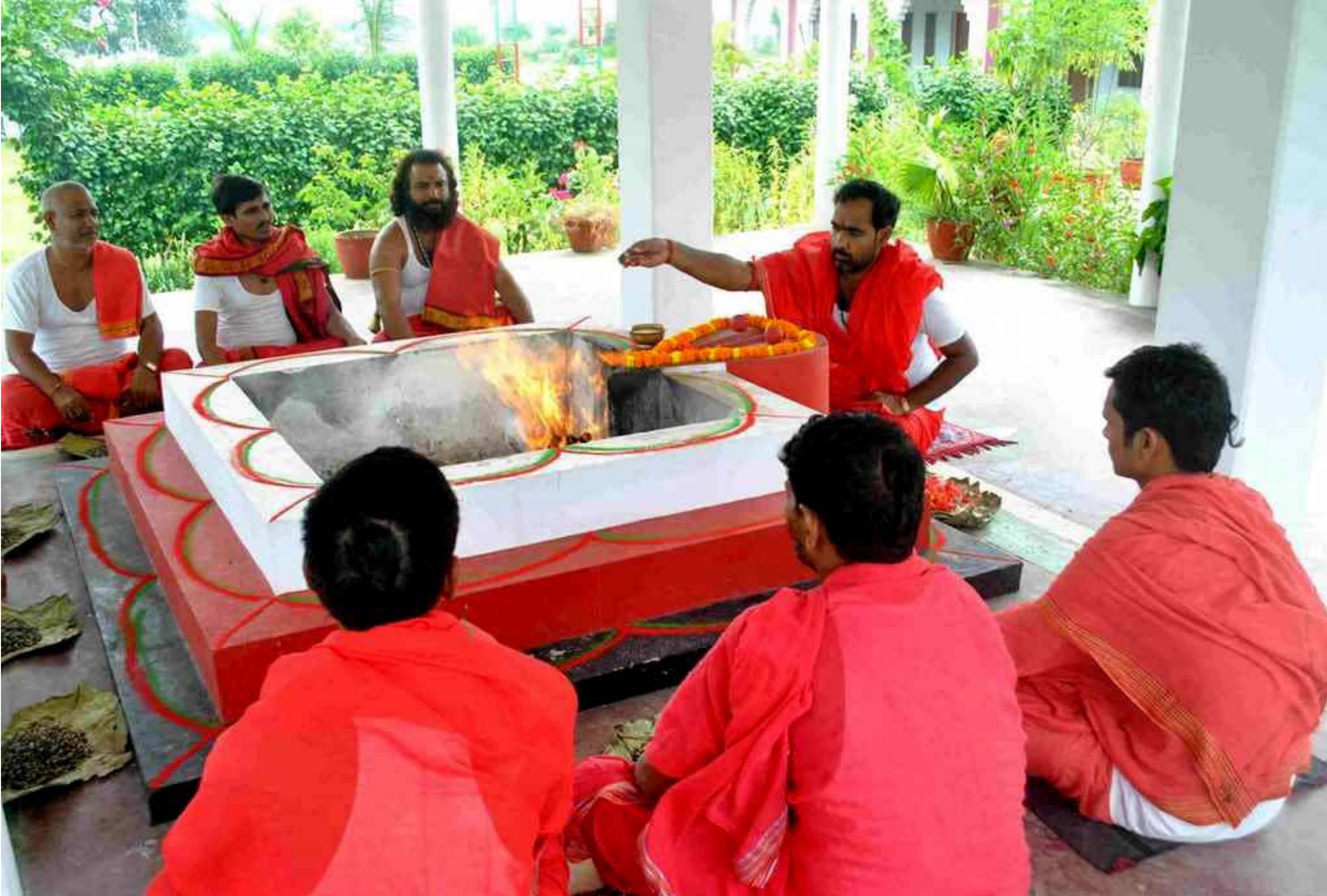
The day's yagya performance concludes with the performance of the traditional fire ritual called homam or havan in which various ingredients are offered into the sacred fire along with ghee and wood.