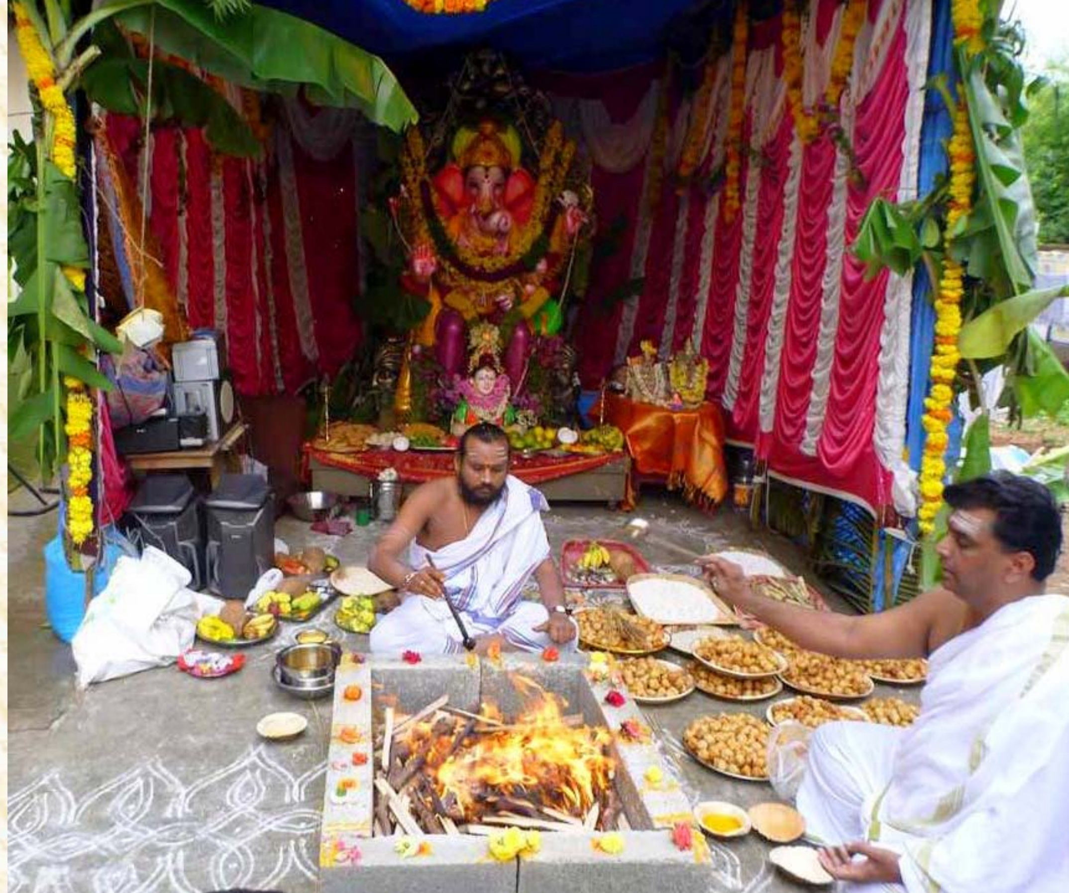
Vinayaka Chaturthi concluded with a fire ritual in which the 1008 modaka balls were offered into the yagya fire while vedic mantras were recited.