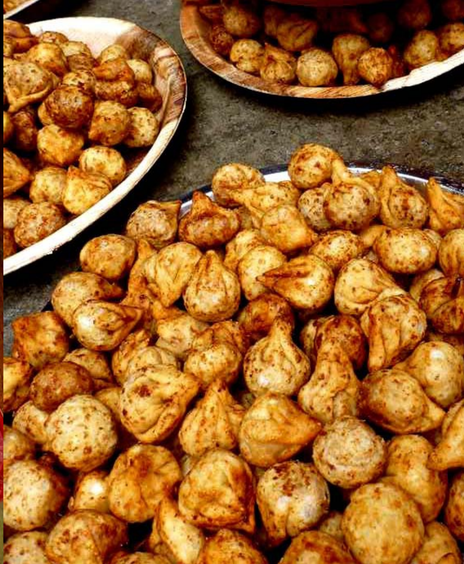
Ganesha is well known for his appetite and so there are 1000 sweet modaka balls to be offered along with sugar cane, fruit, puffed rice, and coconuts