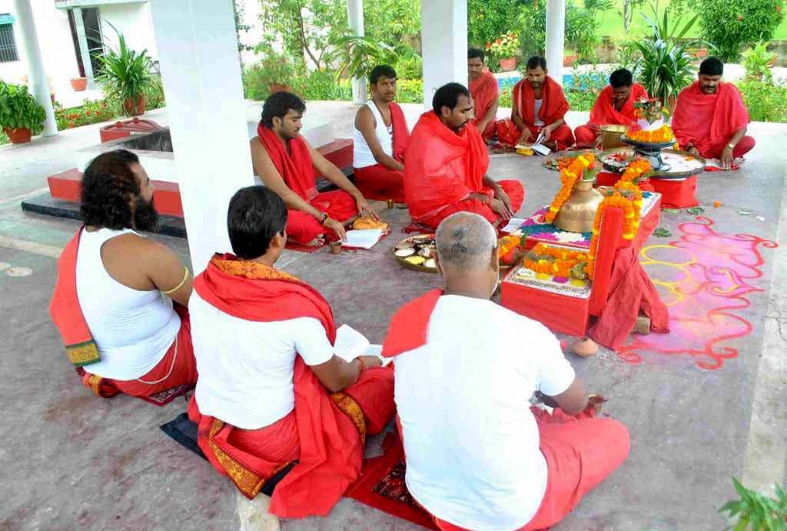
The yagya continued with a recitation of the 700 verse Durga Saptashati , also known as the Chandi Path which tells the story of Shakti; all the powerful forms of the goddess who eliminate darkness and bring light to life.