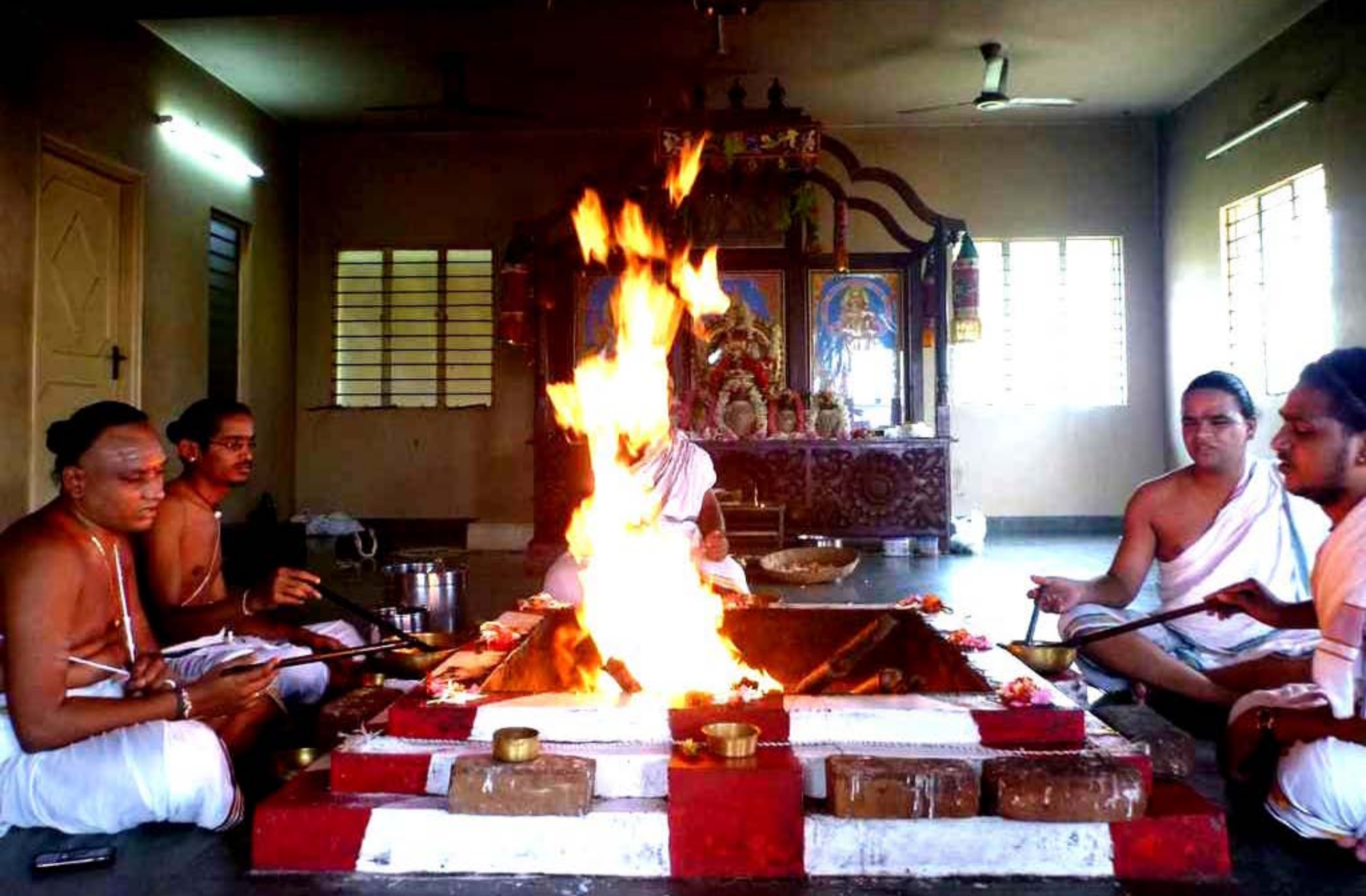
The Sama Veda Yagya concludes with a large fire ritual (havan). Next we go to one of the ancient Shiva temples in Kanchipuram for a grand Rudra Abishekam including some of the young pundits-in-training from one of the many local patasalas.