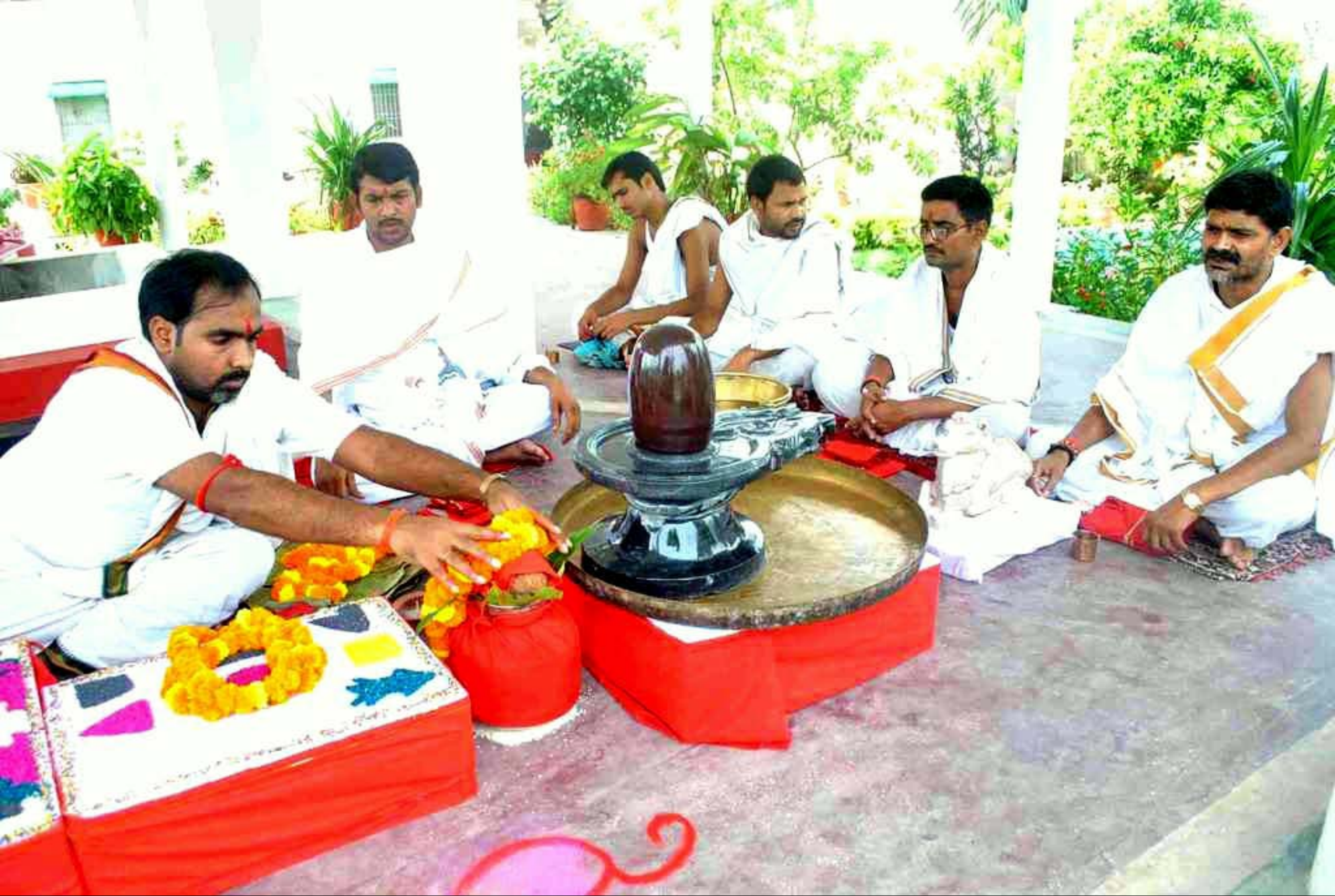
The pundits performed a complete Rudra Abhishekam for Shiva.